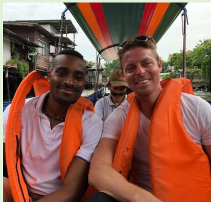
LAKE RIDE IN THAILAND

We love traveling and exploring the world together. One of the things that quickly drew us together was our curiosity to explore other parts of the world. We love experiencing different cultures, tasting local foods, and seeing all the amazing beauty on this earth. We cannot wait for your child to join us on our explorations and learn about the world.