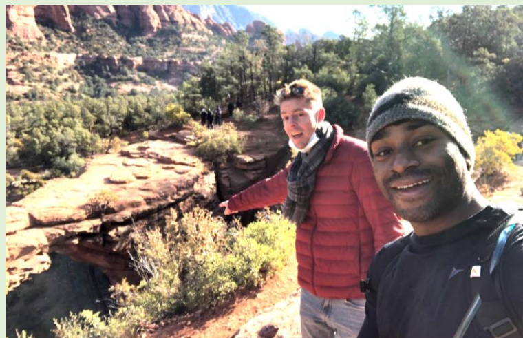
HIKING THE GRAND CANYON