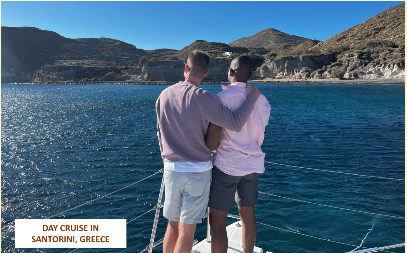
DAY CRUISE IN SANTORINI, GREECE