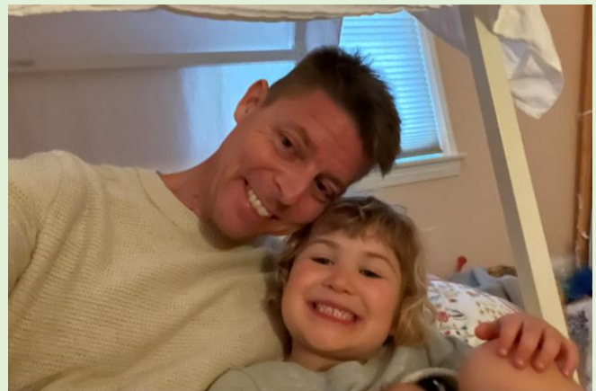
BEDTIME READING WITH FRIEND'S DAUGHTER