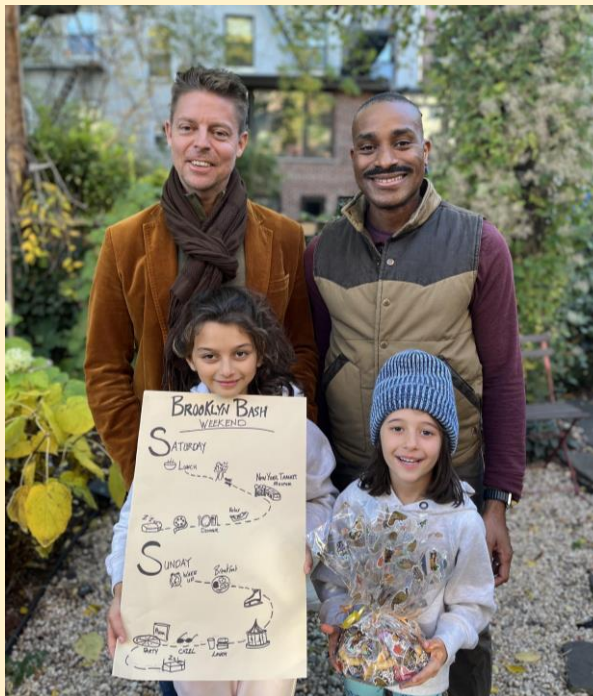
HOSTING FRIENDS' CHILDREN FOR WEEKEND

Expose your child to cultural diversity including travel, art, music, science, books and sports, to benefit from all that the world has to offer.