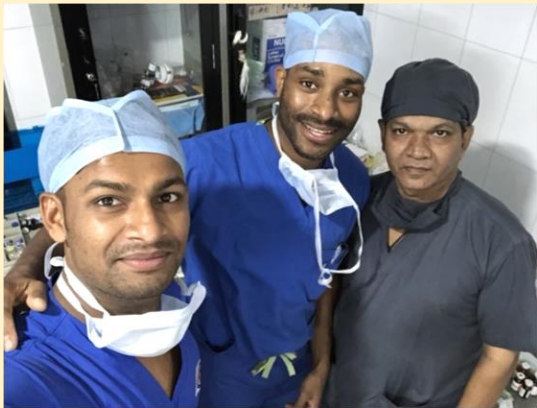
SURGICAL MISSION TRIP TO INDIA

I enjoy going on short, international mission trips to provide anesthesia. Other hobbies are running, hiking, lifting weights, singing and making music. I especially love cooking various tasty meals!