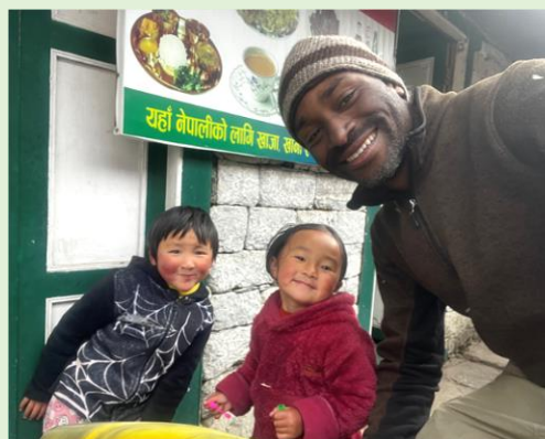
SAYING HI TO CHILDREN ON A MOUNTAIN HIKE IN NEPAL