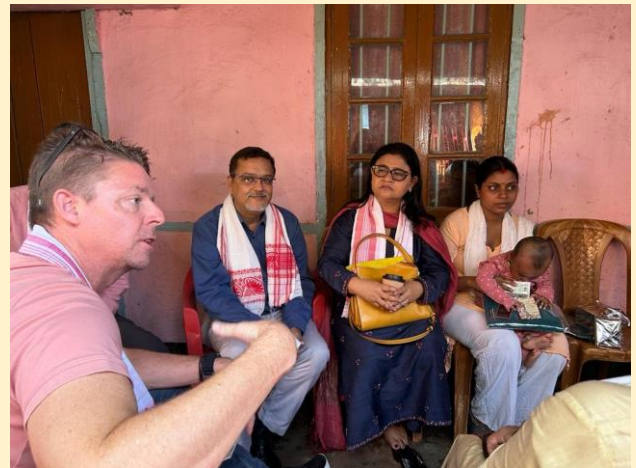
WORKING IN ASSAM, INDIA

After graduating, I did business consulting, where I got my passion for travel. After 5 years, I made a big life change and joined the Peace Corps where I served in a remote village in Kenya, East Africa, teaching business skills to local farmers. Peace Corps changed my life personally and professionally.