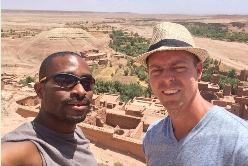
IN THE MOROCCAN DESERT