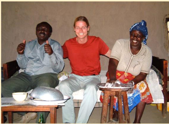
PEACE CORPS HOSTS IN KENYA

For the past 20 years, I've been doing global health work, first fighting malaria in Africa and now focused on improving maternal health in poorer countries – primarily in Africa and in India.