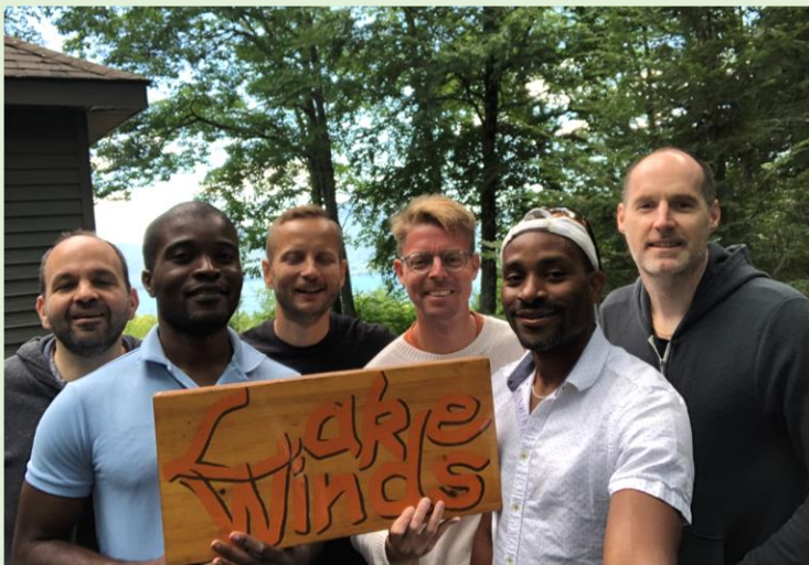
WITH FRIENDS AT LAKE GEORGE, NEW YORK

He was able to hold his sister's son when he was born in the US before they moved back to Ghana. He's frequently in touch with them and can't wait for them to move back to the US.