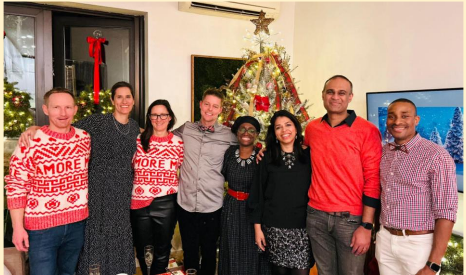
HOSTING OUR ANNUAL HOLIDAY PARTY

We are also close to the Brooklyn Academy of Music that provides numerous afterschool programs for children to expose them and teach them about the arts and music.