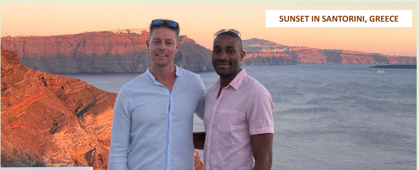
SUNSET IN SANTORINI, GREECE

We love traveling and exploring the world together. One of the things that quickly drew us together was our curiosity to explore other parts of the world. We love experiencing different cultures, tasting local foods, and seeing all the amazing beauty on this earth. We cannot wait for your child to join us on our explorations and learn about the world.