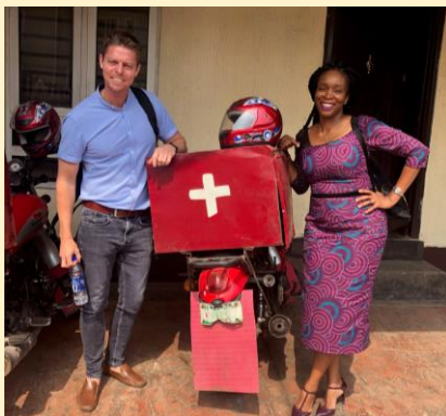
WORK TRIP TO NIGERIA

For the past 20 years, I've been doing global health work, first fighting malaria in Africa and now focused on improving maternal health in poorer countries – primarily in Africa and in India.