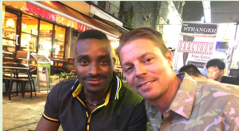
EVENING IN BANGKOK, THAILAND