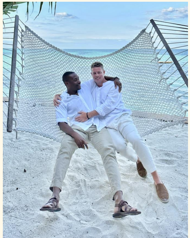
ENJOYING A HAMMOCK ON THE BEACH

We have an amazing life together and can't wait to start our family through adoption. We believe there is a child out there waiting to be adopted into our family and we are hoping that their birth parents will find us soon. Maybe that parent is you and we look forward to sharing our dreams of adopting and becoming dads!