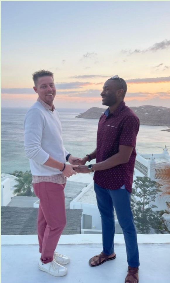
DANCING IN MYKONOS, GREECE