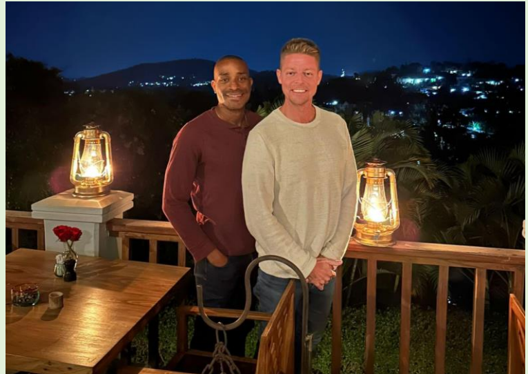
DINNER IN ARUSHA, TANZANIA

After 8 years together, we are both at a stage in our lives where we have the resources to provide a loving and nurturing home to a child.