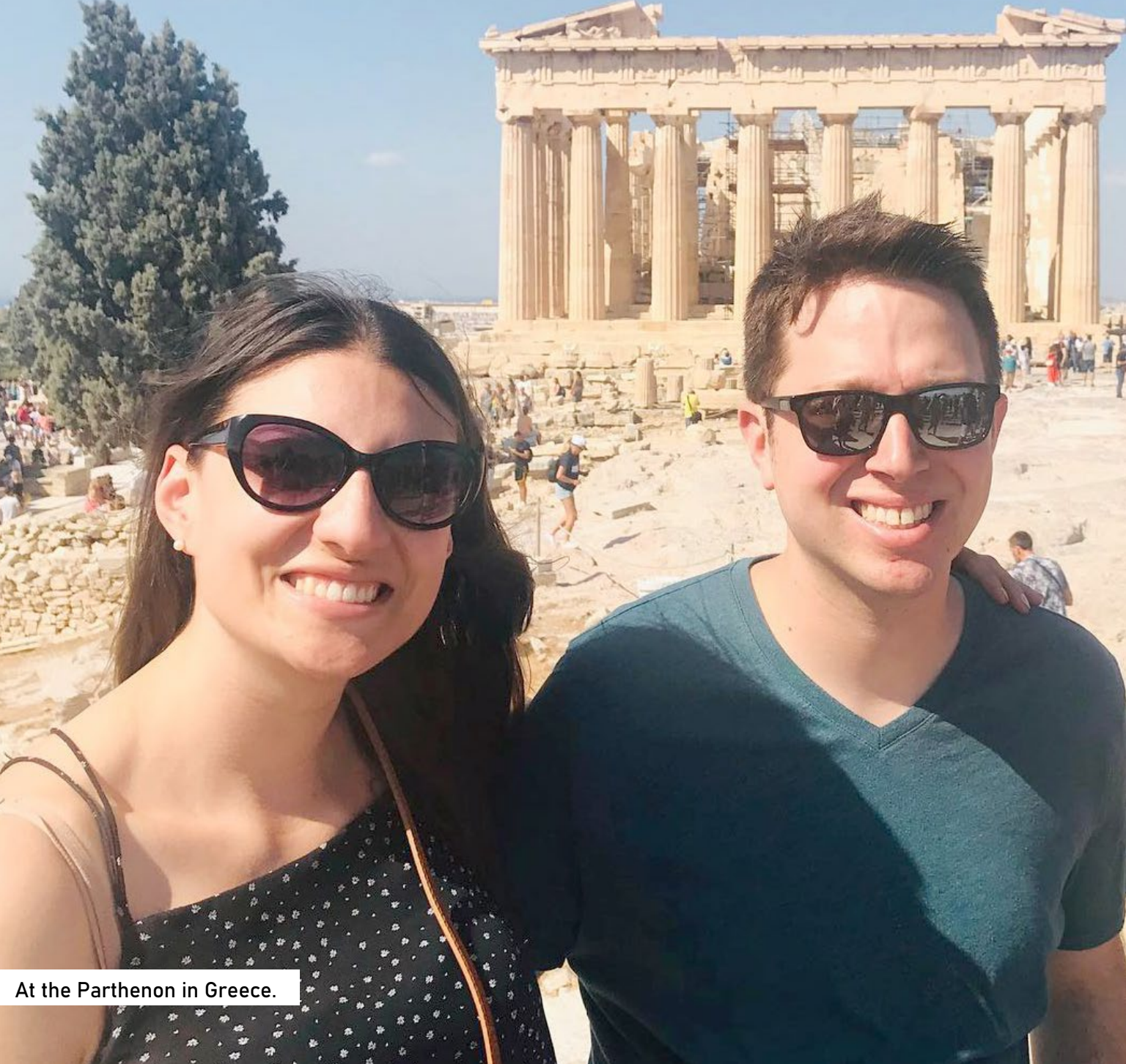
At the Parthenon in Greece.

Whether just planning a day trip or going away for a week-long trip abroad, we love to explore new places together.