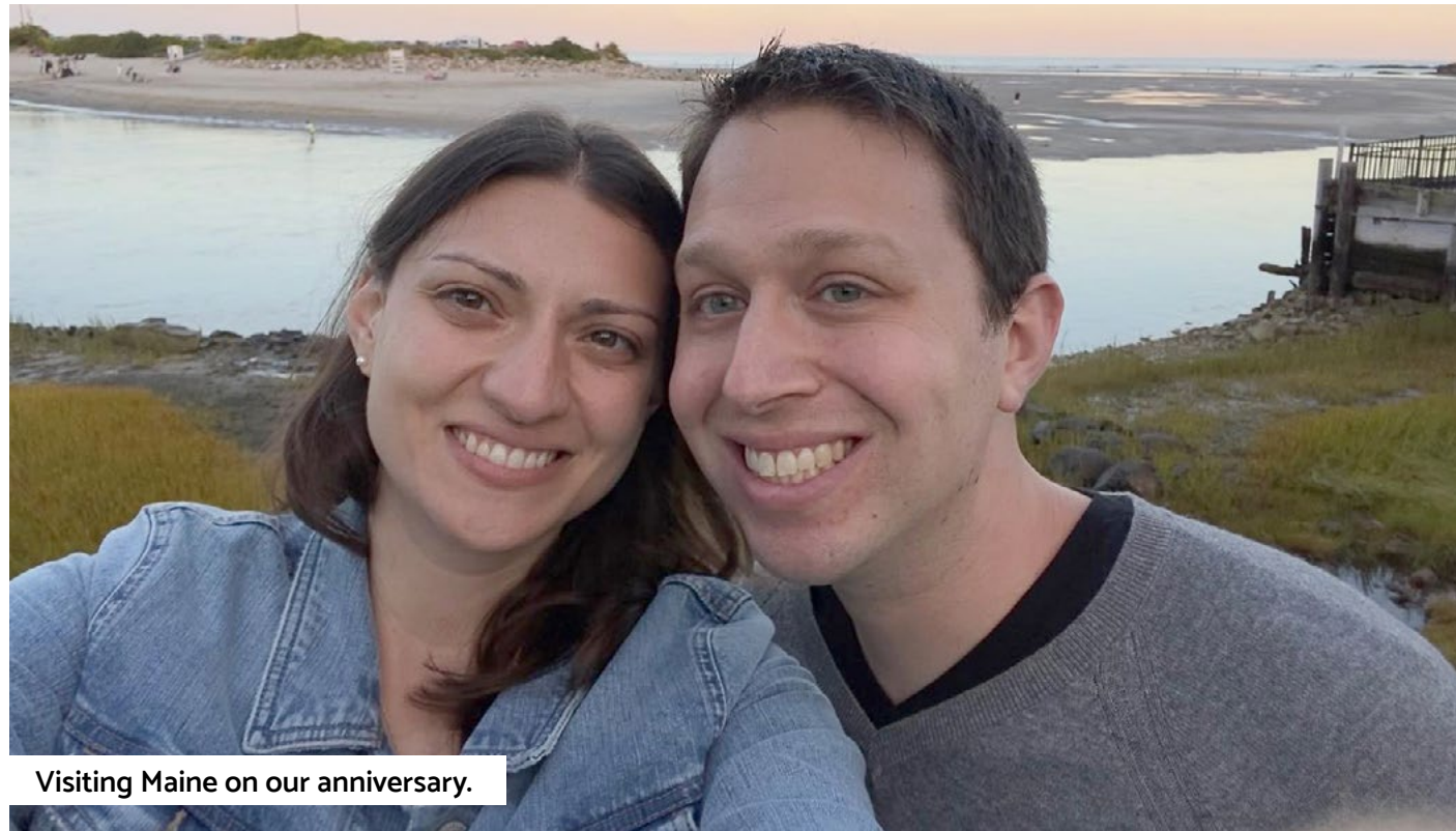
Visiting Maine on our anniversary.