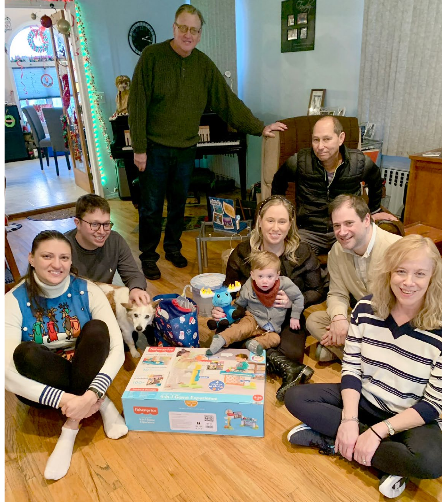
Spending the holidays with both of our families.