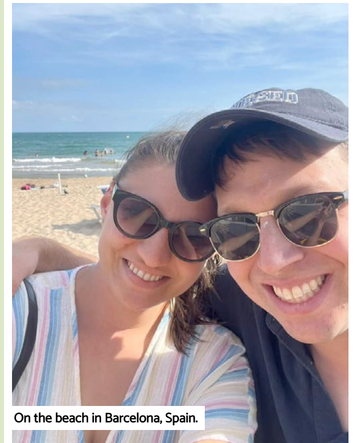
On the beach in Barcelona, Spain.